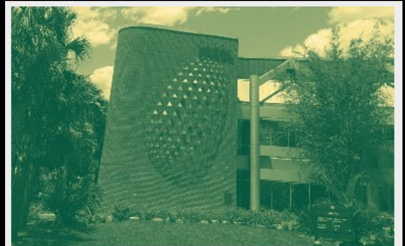
CREOL, The College of Optics & Photonics