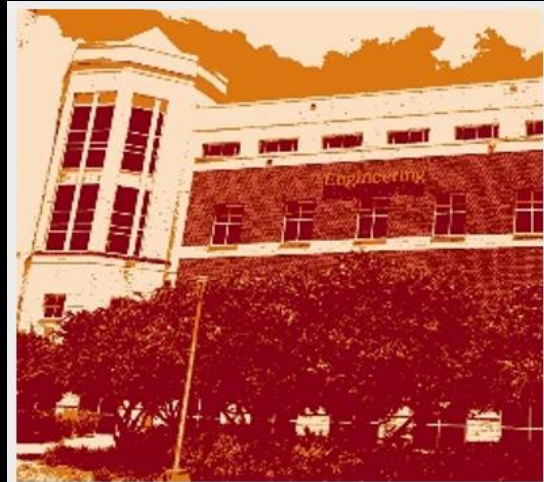
College of Engineering & Computer Science (CECS)